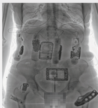
Smart HD images for increased penetration and resolution